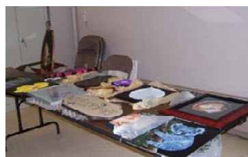
Show and Tell