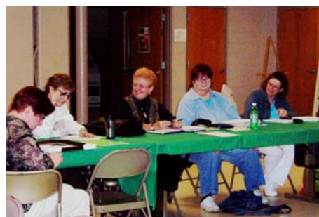
Down to business